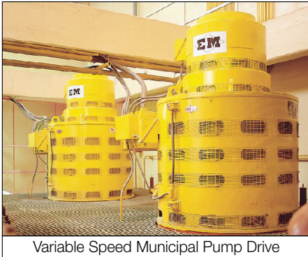
Variable Speed Municipal Pump Drive