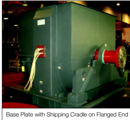
Base Plate with Shipping Cradle on Flanged End